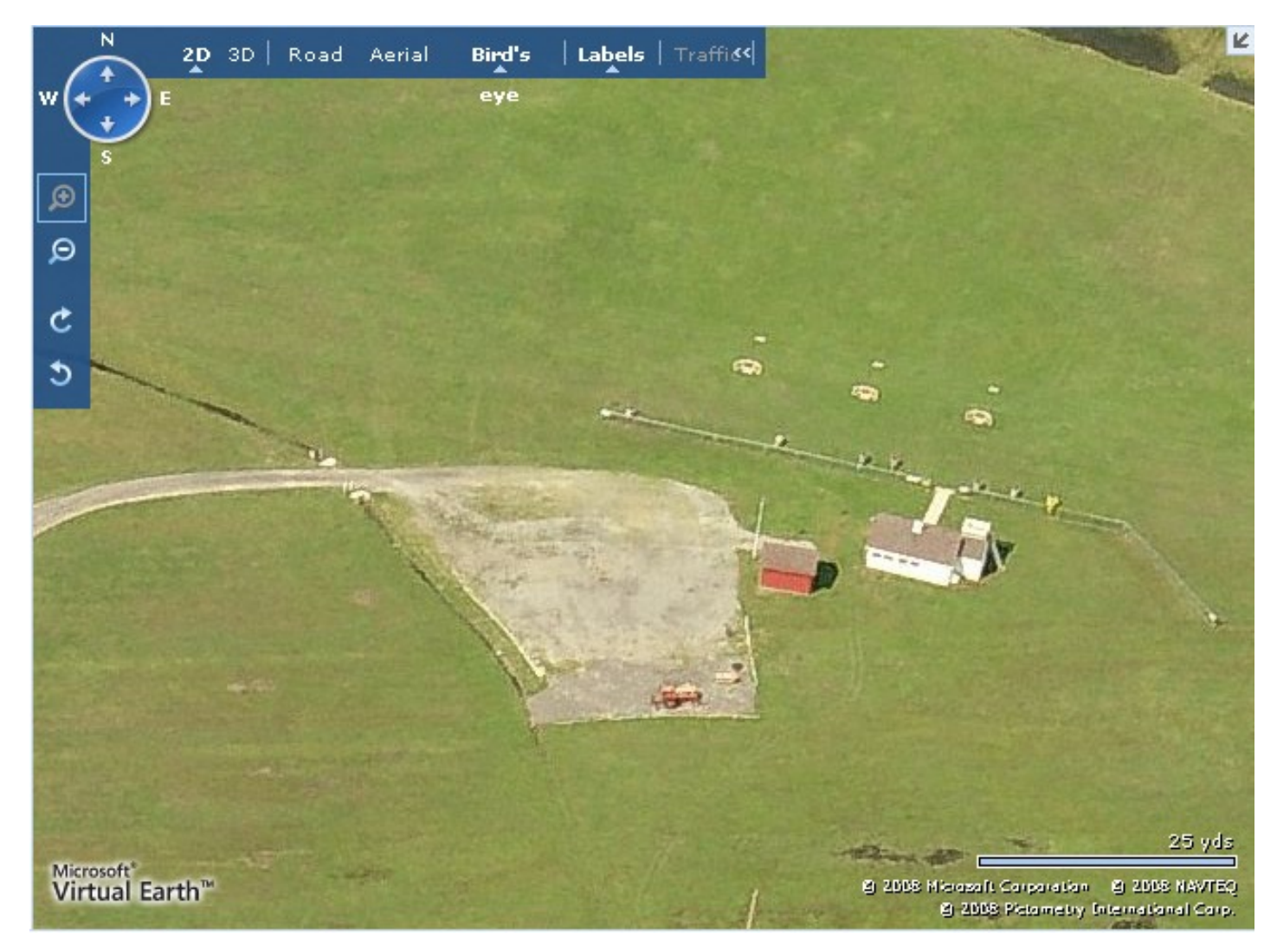
STARS Field Satellite photo